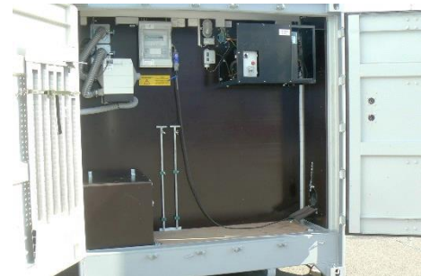
All the container's accessories are controlled from the accessory compartment.

Quality Management: ISO 9001, AQAP 2110, ISO 14001