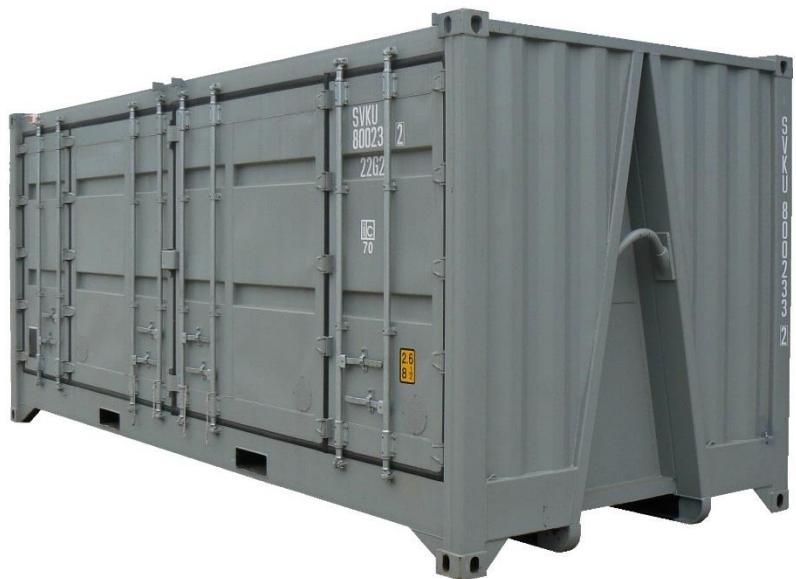
Container is designed on standard shipping container with integrated hook end.

Sales: Pasi Hakala tel. +358 40 152 9668 info@morehouse.fi