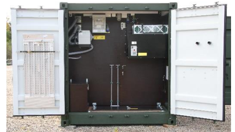
All the container's accessories are controlled from the accessory compartment.

Designed in compliance with: (2006/42/EEC), (72/23/ETY)